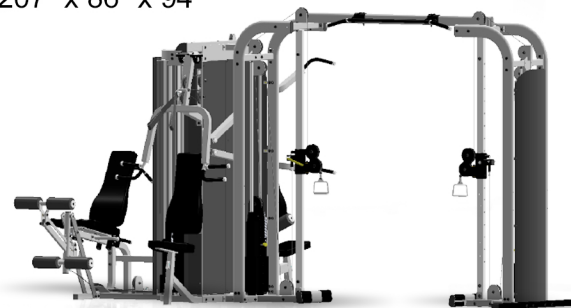
6090CS 177" x 86" x 94"

Visit www.inflightfitness.com to see our entire line of exercise equipment.